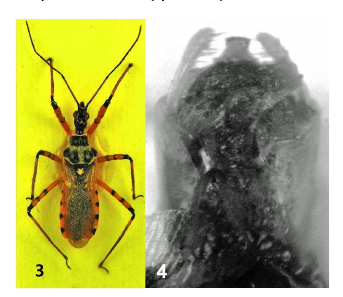
Figs 3-4. Sphedanolestes annulatus. 3. color variation of the specimen from Jordan (Ajlun, Sakib). 4. pygophore, dorsal view, in situ (Jordan, Ajlun).

There are differences between the specimens from Iran and those from Jordan and Israel (Fig. 5), in the colour of the pronotum, scutellum and antenna, but for the rest, the distinctive features of this species are the same than the holotype.