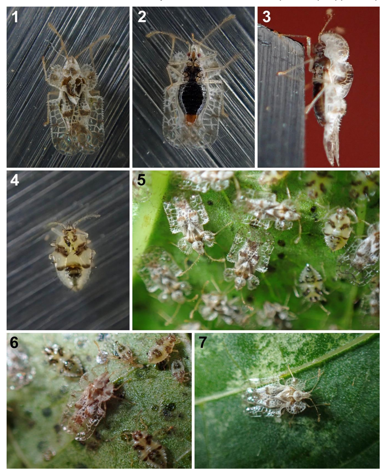
Figs 1-7 . Corythucha gossypii (Fabricius, 1794), specimens collected and observed in Vanuatu: 1–3 – habitus of adult: 1 – dorsal view; 2 – ventral view; 3 – lateral view; 4 – habitus of larva; 5–6 – living specimens from Lowanatom area on the leaf of Ricinus communis ; 7 – detail of a living specimen from Mystery Island on the leaf of R. communis .

and non-areolate (Blatchley 1926; Slater & Baranowski 1978; Mead 1989). Useful keys for the identification of species of the genus Corythucha were provided by Gibson (1918) (for all the species), Blatchley (1926) (for North American species), Slater & Baranowski (1978) (for the United States and Canada) and Mead (1989) (for Florida).