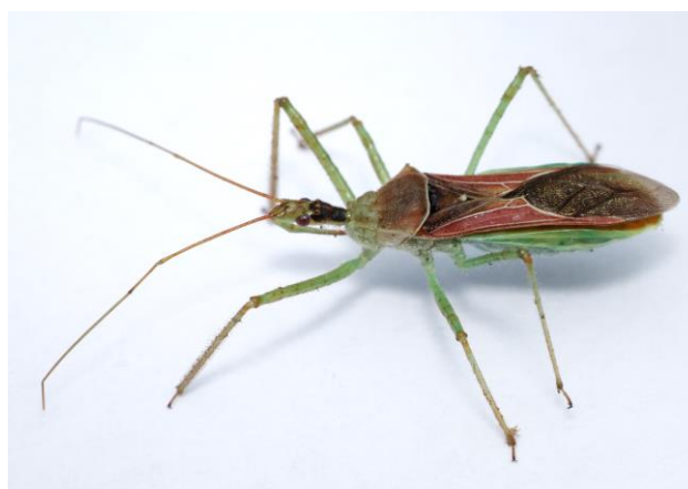
Fig. 1. Female of Zelus renardii Kolenati, 1857 captured on Pianosa, Italy; after oviposition.

The second author would like to thank the following organisations for the opportunity to participate in the Summer School in Entomology “Meet the Experts!” on the islands of Elba and Pianosa and to sample some specimens: World Biodiversity Association, Nuovo Gruppo Entomologico Toscano, Successione Ecologica APS in collaboration with NatLab and Parco Nazionale Arcipelago Toscano.