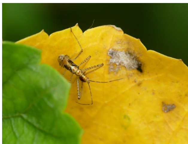
Fig. 1. Nymph of Zelus renardii Kolenati, 1857, Algiers, Algeria.