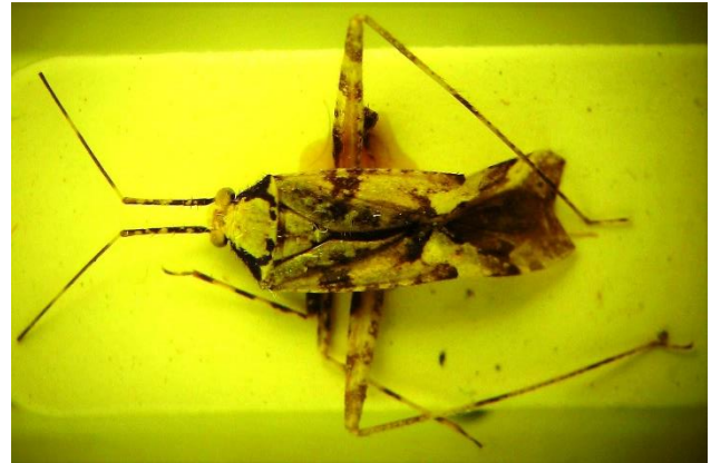
Fig. 7. Phytocoris (Phytocoris) tiliae tiliae.

Remarks: This zoophytophagous species is new in Albania. It lives on several plants like Tilia , Quercus , Sorbus , and Populus . Adults are found from June to September, and the species overwinters as eggs (Wagner 1970/71).