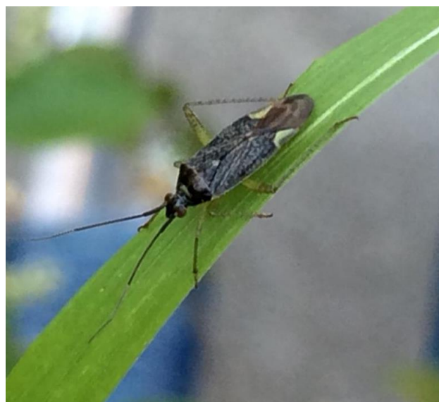
Fig. 4. Closterotomus trivialis , female.