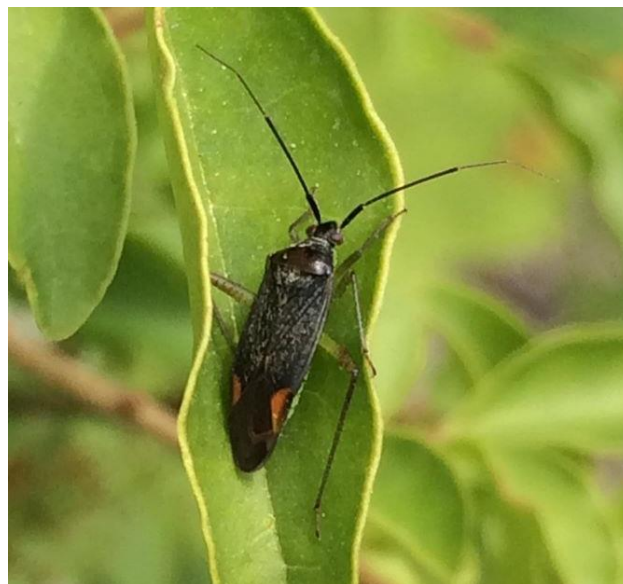
Fig. 3. Closterotomus trivialis , male.

It has been repeatedly reported on different plants (Barbagallo 1970): the olive tree ( Olea europea L.), medical herb ( Medicago sativa L.), peach tree ( Prunus persica (L.), on citrus fruits ( Citrus spp.) such as orange, mandarin, and clementine; only exceptionally on the lemon tree. Another arboreal fruit host plant is the apricot ( Prunus armeniaca L.). This can also be found on Pitosporum tobira (Ait.) abundantly. According to this author, the herbaceous plant favored by the insect, especially during the preimaginal development, is nettle ( Urtica urens L. and U. membranacea Poir. = caudata Vahl.); also, it has frequently been found on Parietaria officinalis L. and more rarely (although sometimes in a considerable number of adult specimens) on the following plants: Calycotome spinosa Lk., Genista sp., Phaseolus vulgaris L., Ferula communis L., Brassica spp., Malva silvestris L., Chrysanthemum coronarium L., Hordeum murinum L., Bromus sterilis L., Papaver rhoas L.