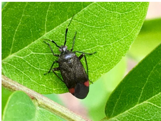
Fig. 2. Closterotomus reuteri.

Remarks: The species is new in the region of Kosovo and the second record in former Yugoslavia: Belgrade (Protić 1998). Ligustrum vulgare L. is the only known host plant (Wagner 1970/71).