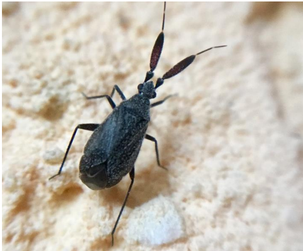
Fig. 5. Excentricus planicornis , total habitus in dorsal view.

Remarks: The species is new in the region of Kosovo. In Serbia, it was recorded only in two localities near Belgrade: Barajevo and Mala Mostanica (Protić 2004). The new record is the southernmost of its distribution area. The species lives on Cytisus radiatus Scop., but was also found on Rosa sp. The adults were found in July, wintering as eggs (Wagner 1970/1971).