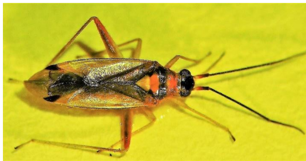
Fig. 1. Campyloneura virgula.